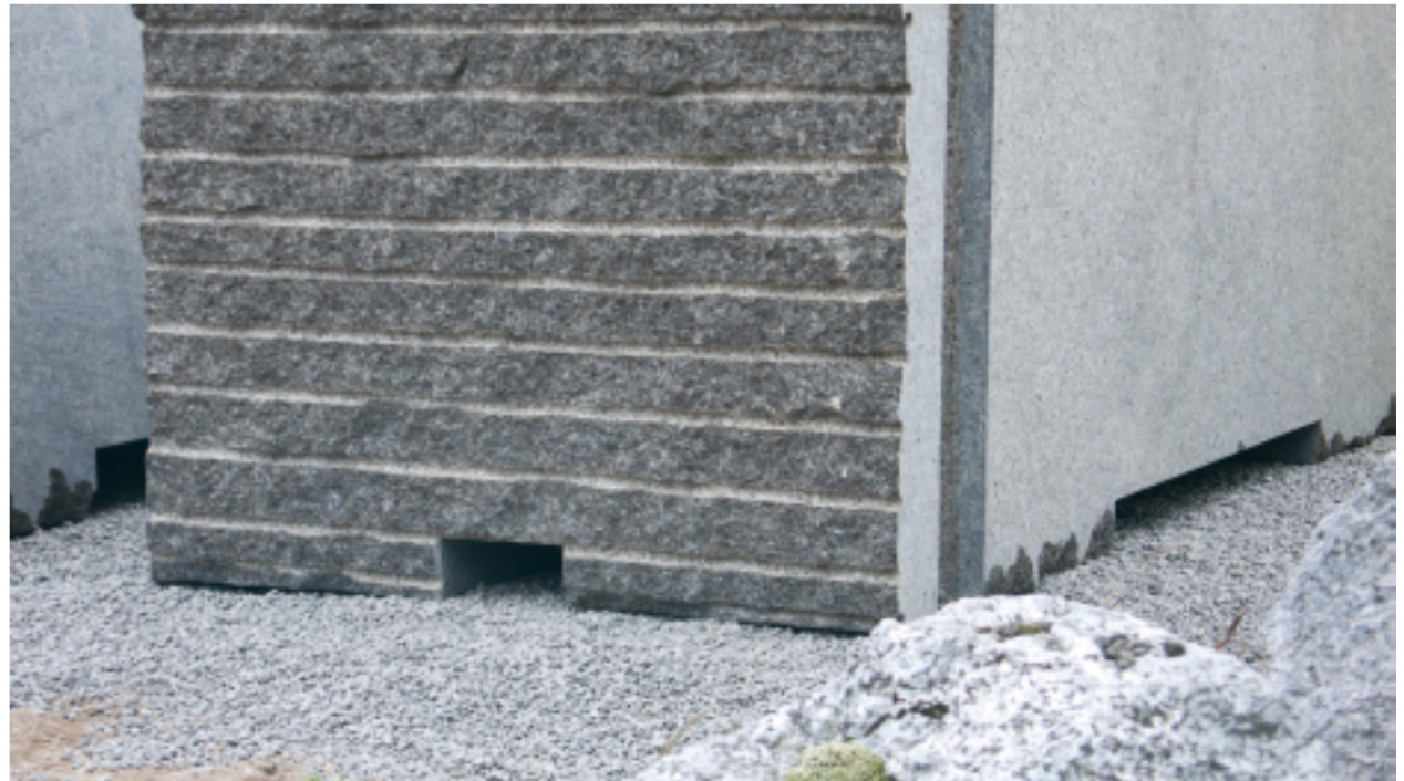
About Mum's Children / details / language of mining