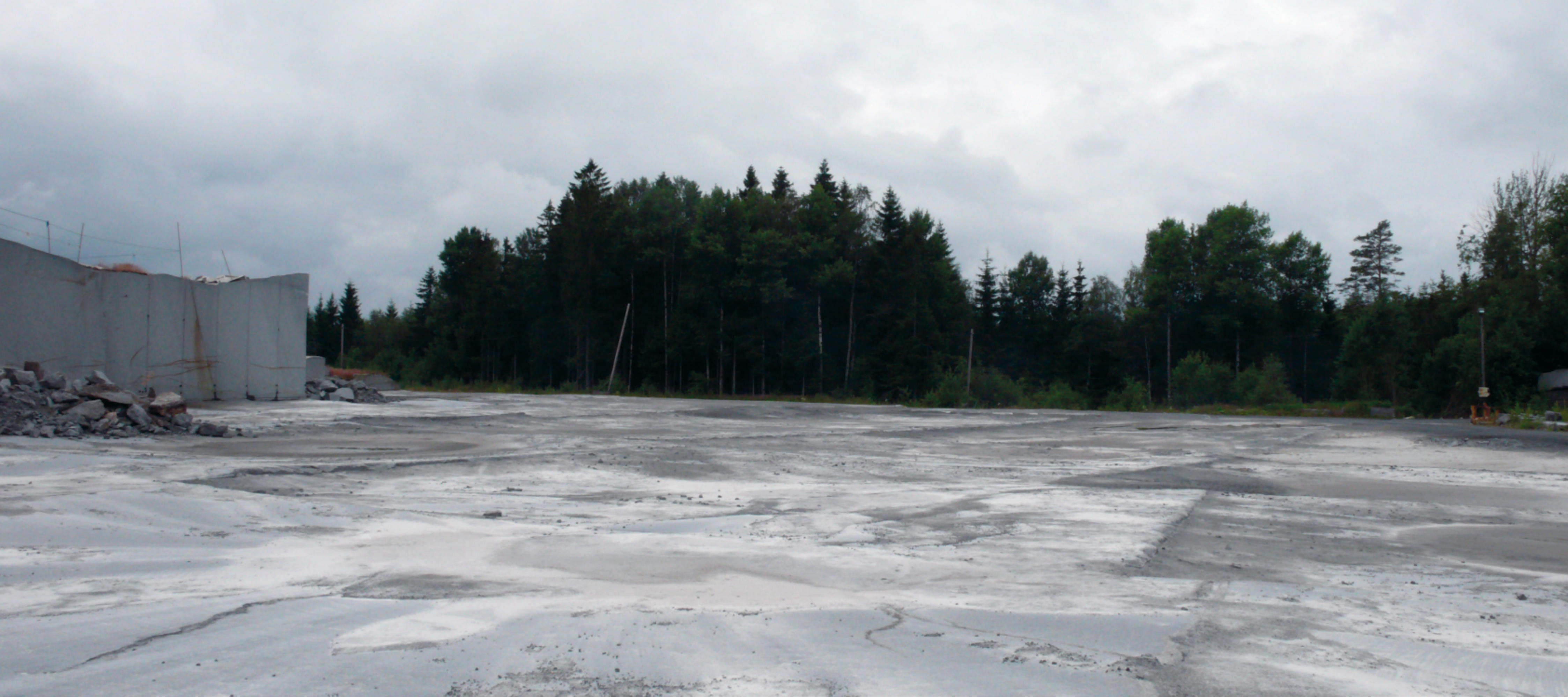
Quarry Håkestad / Norway